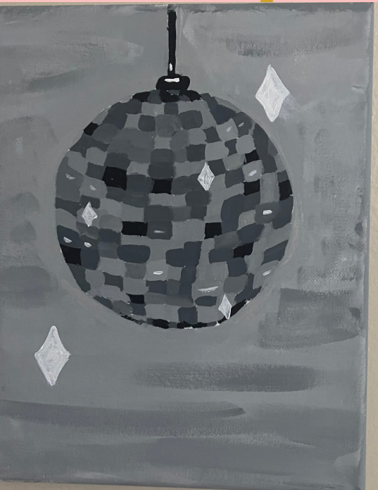
Mirrorball, by Hafitha Ayyad Acrylic Paint